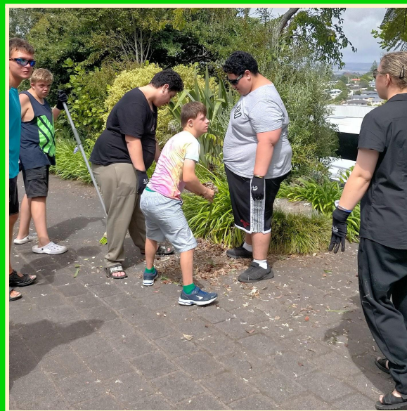
Gardening at St George's Church