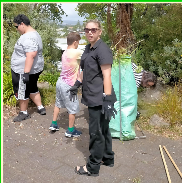
Work Experience & Fundraising