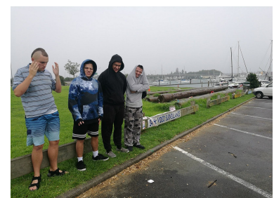
Tauranga Harbour Bridge