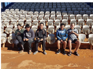
Speedway - Baypark