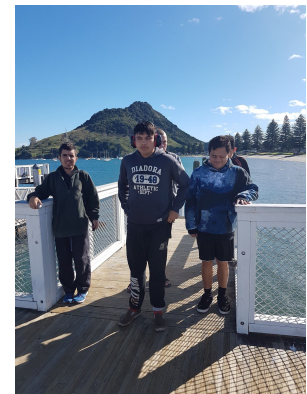
Pilot Bay & Mauao