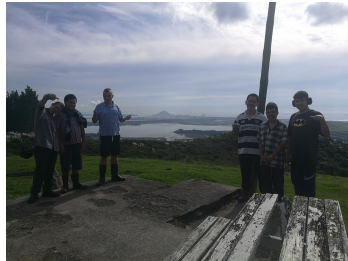
View of Tauranga Harbour