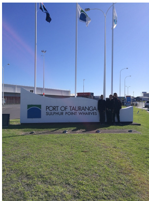
Port of Tauranga