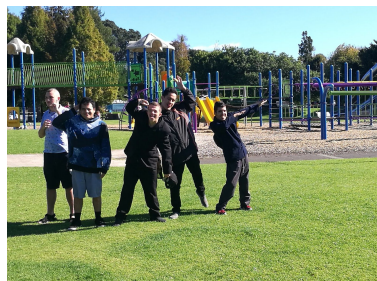
Memorial Park - Jungle Gym